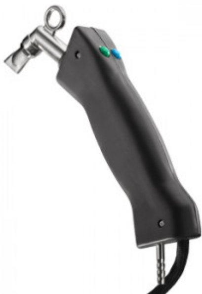
Stainless steel spotting arm and steam/air gun for hot spotting