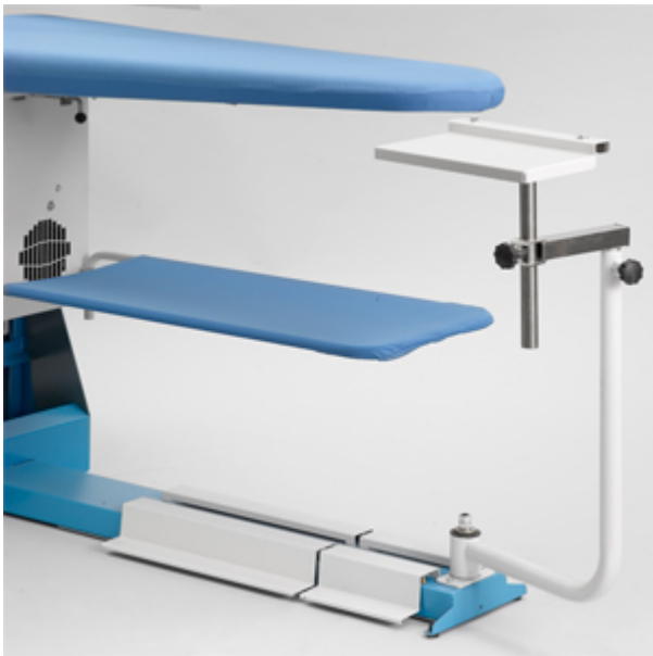
Pivoting iron support for point-to-the-right operation