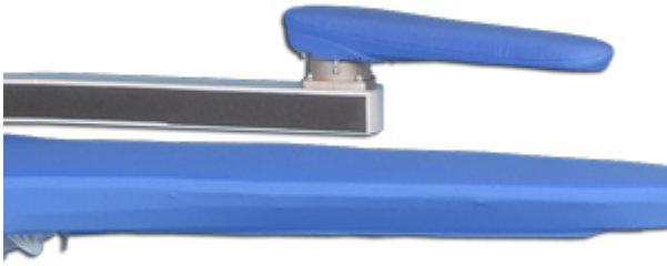
Vacuum and blowing sleeve arm