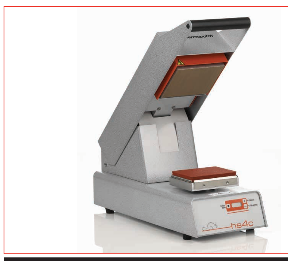
Highlights • Automatic opening • High performance heater • Digital controls and display

The HS-4-C family is versatile, compact and swift. Now you can choose your perfect heat seal press in our range of three. This type of press is ideal for those who work in health care or the clothing industry.